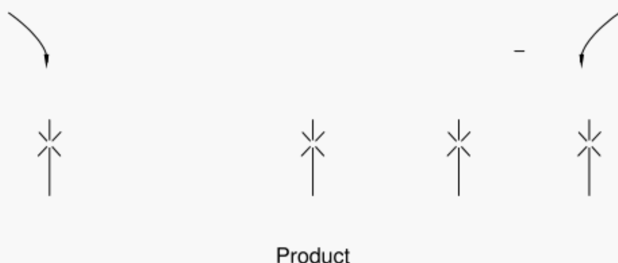
Figure 2—Internal Floating Roof